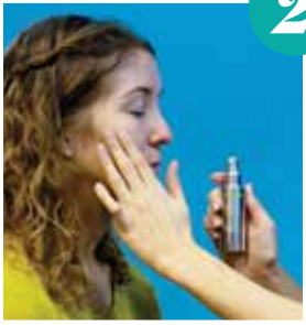
Once the skin has dried, apply a layer of primer to the face. Work the product into the skin to ensure all the oil is absorbed.