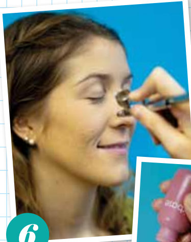
Use blush to add contours using the same, circular application method as with the foundation. About eight drops of blush should produce enough colour for a subtle finish.