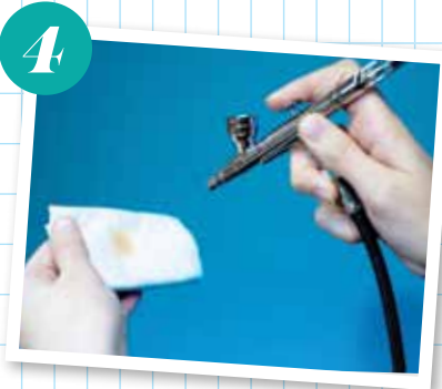
Mix the foundation using the desired mix of Airbase's seven base colours. Check the colour by blowing some product onto a tissue before applying it to the client's face.