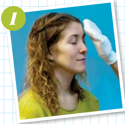
Using the microfibre cleansing mitt, which has been soaked in warm water, gently cleanse the client's face.

Luckily, airbrush application is easy to master and produces stunning results. To show readers just how simple airbrushing is, Vitality has called in Airbase to demonstrate how it's done.